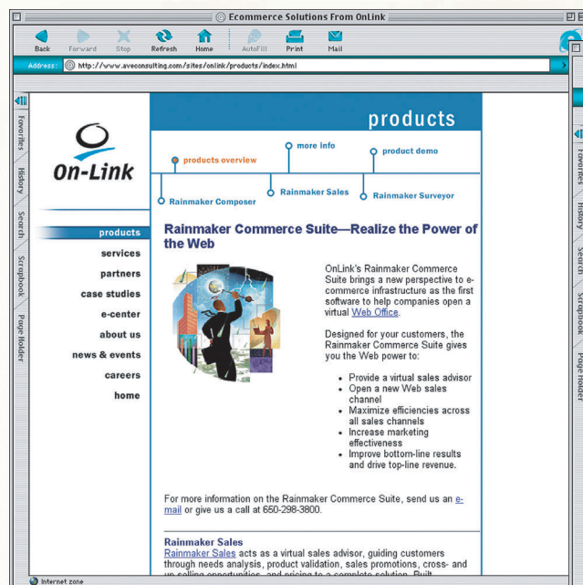
OnLink product page