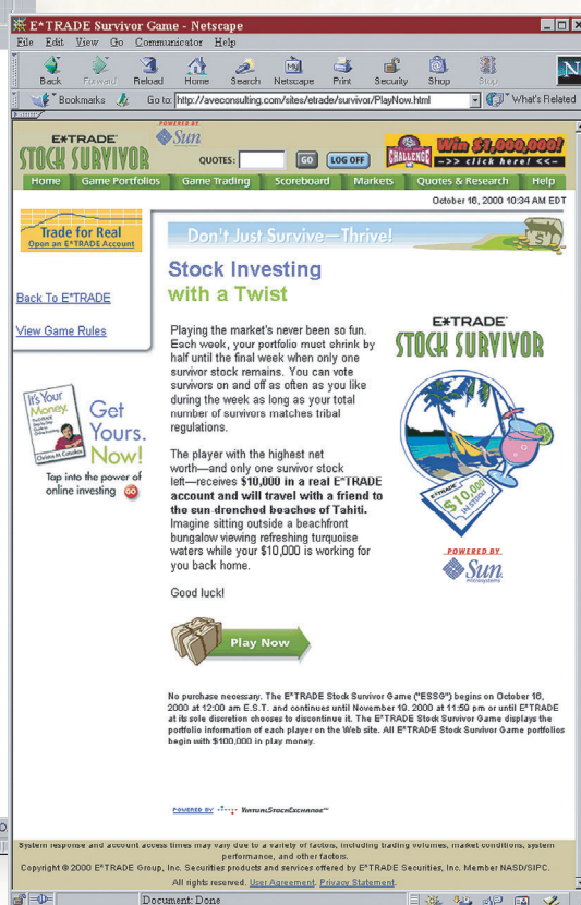
E*TRADE Stock Survivor home page